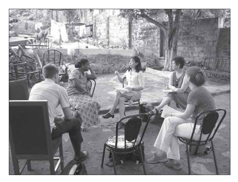
Minnesota Advocates staff and volunteers conducting fact-finding interview in Freetown. Sierra Leone.

by bringing it to the attention of the international community. In the end, human rights monitoring also puts pressure on the government to comply with the truth commission's recommendations.