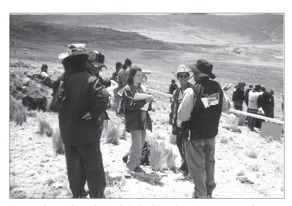
Minnesota Advocates volunteer observing the Truth and Reconciliation Commission-sponsored exhumations of mass graves in Lucanamarca, Peru.

Human rights monitoring can play a vital role in the success of transitional justice processes. Human rights monitors' investigations and published observations uphold the integrity of the process; monitors provide moral and emotional support for victims who make the difficult decision to provide testimony; and monitors further legitimize the transitional justice process