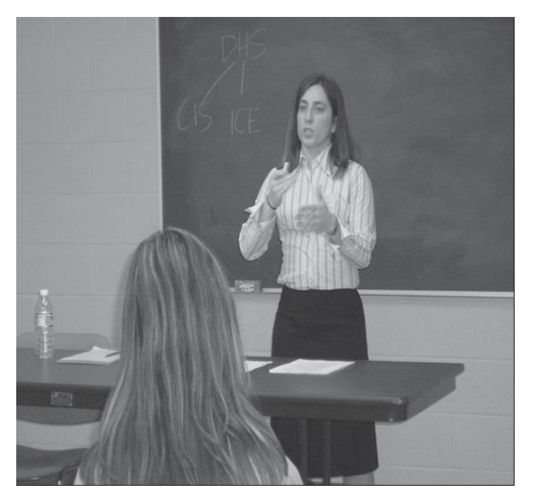
As part of the Battered Immigrant Women Documentation Project's education and advocacy efforts, Minnesota Advocates provided training on immigration law at the Central Minnesota Conference on Domestic Violence and Immigration (April 2004).

ticular needs of refugee and immigrant victims of domestic violence. International law is the standard used, rather than the extent of the government's protection of and provision of services to nonimmigrant women. The project's Steering Committee guided the report drafting process, reviewed and provided feedback on the report, and made recommendations for final follow-up interviews. The Steering Committee also provided Minnesota Advocates with advice concerning strategies for the release of the report as well as the response Minnesota Advocates would likely receive to the report from government and community organizations, including immigrant community organizations.