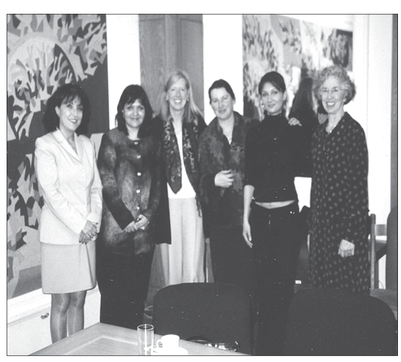
Minnesota Advocates Women's Program staff and volunteers with Bulgarian women's advocates and Bulgarian legislators.

The Bulgarian law passed on its first reading before the Bulgarian parliament on June 30, 2004, and is expected to become law following its second reading in the fall of 2004. The law is a landmark achievement for Bulgarian women and for women throughout the region. It is also an example of the effective use of