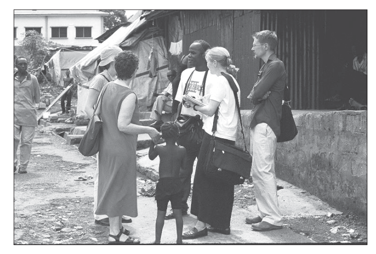
Minnesota Advocates team conducting on-site investigation of conditions at an amputee camp in Sierra Leone.