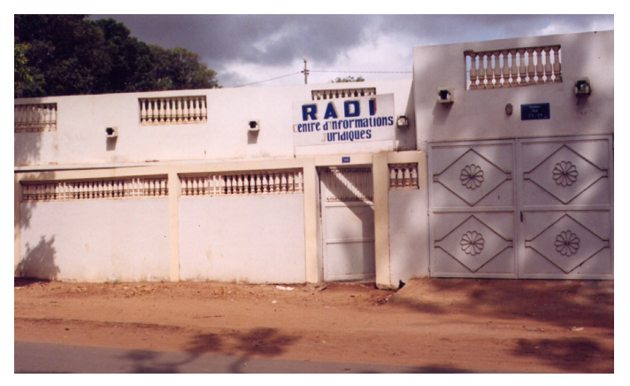
Centre d'Information Juridique (CIJ) Center of Juridical Information) of RADI

Overall, the people's theater plays a vital role in the process of behavioral change. In urban and rural settings alike, the people's theater, which takes place in various national languages and uses its spectators as actors, has always played an important role in moral reformation and the remodeling of ideas of mistreatment inherent in certain social beliefs. In this medium, professional