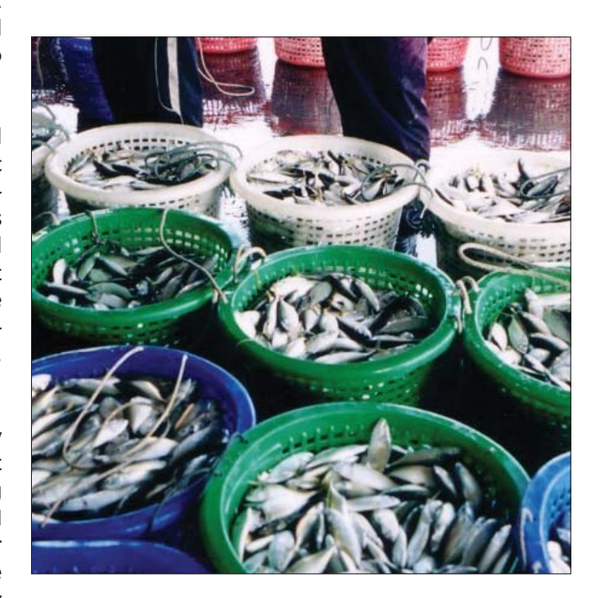
Fish catch of the day

In addition to our experiences working on food security issues in our respective countries, we had enough of a history working together that network members