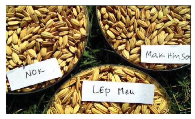
Varieties of rice seeds in Laos

tors on the rights to food and health to monitor government compliance to its human rights obligations. As a direct result of their efforts, the Philippine legislature has decided to adopt some of the organization's agricultural policy proposals.