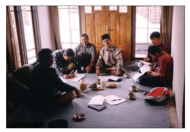
Focus Group Discussions in Vietnam (above) and Indonesia (below)

to, and control of resources and markets, perceptions on trade and agricultural development policies, and consumption information.