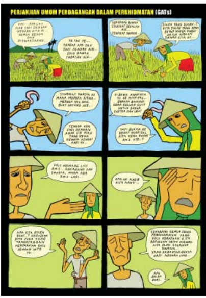
Education workshop (above) and comic book (below), Malaysia