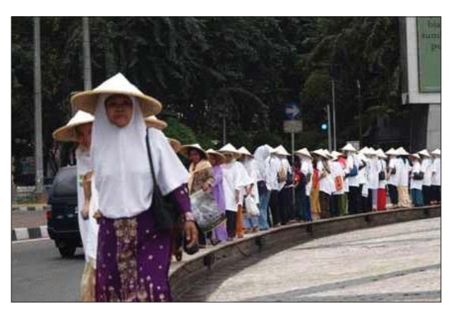
Rally for Trade Justice, Indonesia

Third, there is now a more comprehensive understanding of the ASEAN Free Trade Area (AFTA) agreement both the regional team members and lead researchers have been able to gather a wealth of information and secondary data on the ASEAN Free Trade Area (AFTA) agreement, especially on its implementation at the national level. Some of this data is already incorporated in the country reports. The challenge at this juncture is coming up with analytical papers and packaged in a popular manner for the use of the small scale food producers and civil society groups, not only to gain more knowledge on AFTA but to utilize these materials in moving forward our advocacy goals on policy reforms for the betterment of small scale food producers at the national and regional levels.