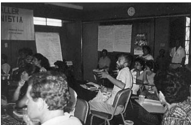
Member organizations of the CNDDHH constantly meet and prepare.

The principle objective of work with the press is that of educating, while at the same time making the members of the CNDDHH sources of reliable information and generators of opinion on topics related to human rights.