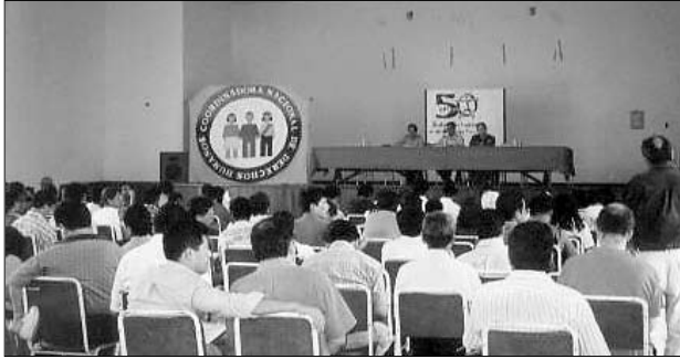
The members of the CNDDHH meet in General Assembly every two years. 1997.