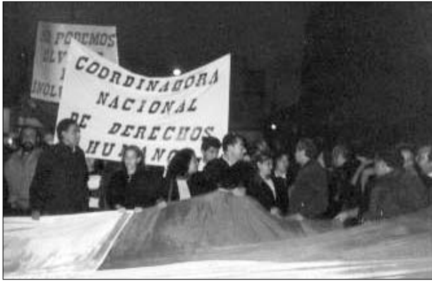
Peace marches during the worst years of the internal armed conflict.

Representation: What makes a coalition representative? The question is related to the typology of the CNDDHH's member organizations and the way that it maintains equilibrium of power among its members. Naturally this has changed with the passing of the years. This is reflected in the election process of the directive institutions. In recent years the number of provincial organizations that make up the Board of Directors have struggled to have a greater presence; without a doubt, the agenda of the human rights movement is shaped by their local problems.