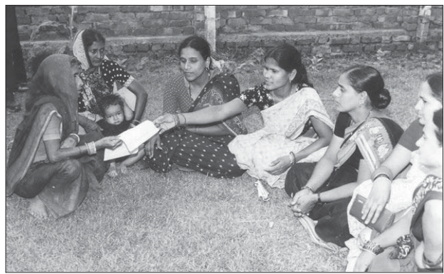
Women mediators are caucusing about a case, Saptari District

These systems continue to play an important role in many parts of Nepal, because it is often impractical for