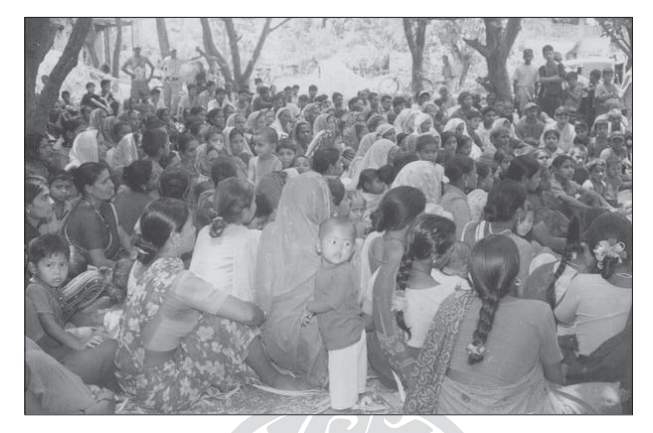
Local people gathered at the awareness programme, Jhapa District

Saptari also lies in the plains region and plains people dominate the population. It sees a large number of disputes, and court cases, and formal forums. Many people there are poor and marginalised and discrimination is prevalent. The local NGO was formed with the help of CVICT which motivated people in rights based advocacy to serve the mediation programme.