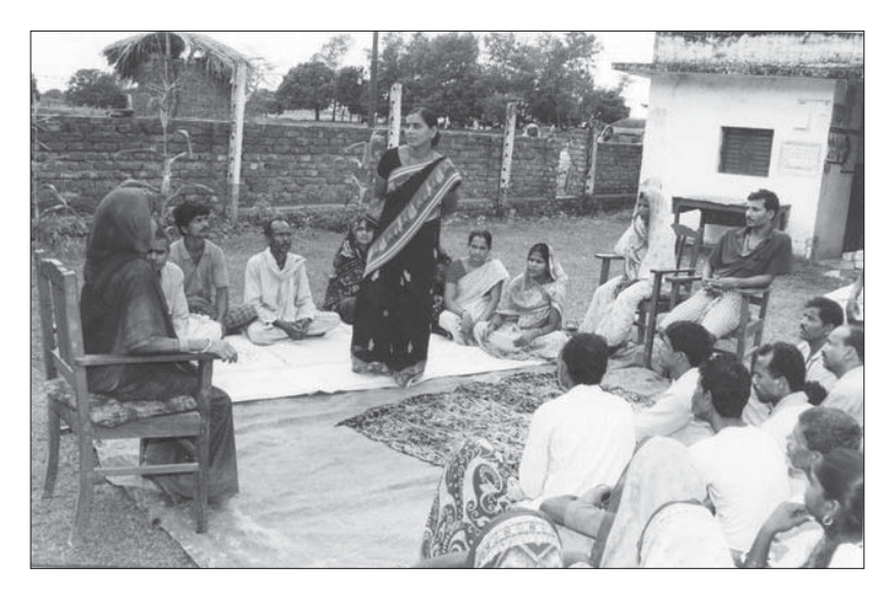
A women mediator addressing the mediation session, Saptari District

In the three districts there are currently 90 HRMCs and 90 WPCs at the Village Development Committee level and 810 HRMCs at the ward level. The WPCs have served approximately 8,000 women who have been included in awareness building programmes and 4,865 women who received basic training on human rights, basic laws and mediation skills. From those who received that training, 1,993 women currently work as volunteers. A total of 964 disputes—out of 1,273—were successfully settled. In addition, legal aid was provided to 24 women