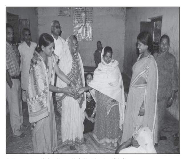
A dispute is settled and concluded with a handshake.

Since local disputes are settled locally in the village, I found that this programme is very relevant and effective in the context of rural part of Nepal. In the rural society, mostly people are poor and as there will be lots of expenses in cases and moreover there will be life long negative relation between the disputants. And, as this mediation is here for remedy for this, it will provide great benefit especially to poor and underprivileged people.