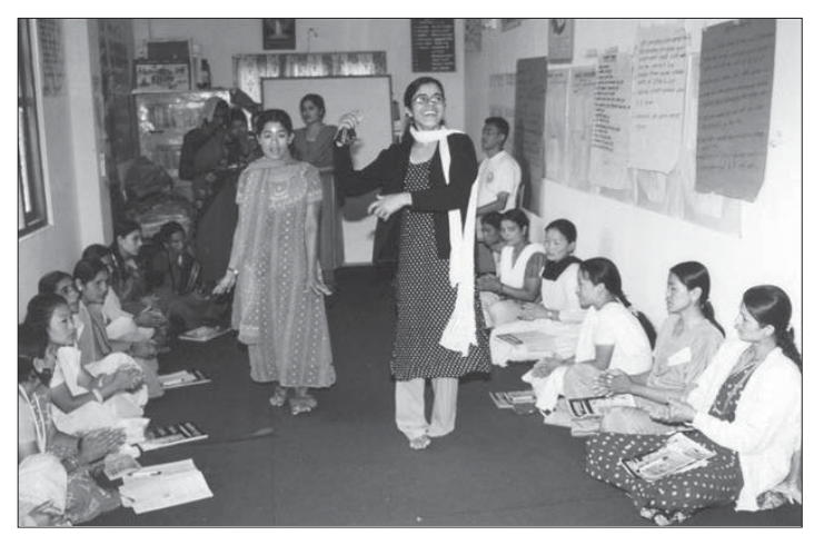
Trainees of the mediators training entertaining in between, Ilam District

Those selected became mediators after receiving training. They also selected one person to participate at the Village Development Committee (VDC) level. An additional five to seven were selected for the ward level committee, and typically the VDC mediator chaired the ward level committee. CVICT then announced the candidates to the people and asked if there was any disagreement regarding those selected. Finally, VDC/CVICT/ and Partner NGO made the formal announcement. CVICT neither selects the mediators nor intervenes in the process of selection. The feeling of ownership by the community and the opportunity to volunteer is important to the programme.