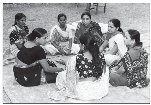
Discussion among women mediators.

The decisions are non-binding and voluntary. The decision or agreement does not carry compulsive obligations to either party in the dispute. There is also an advantage to this as there is always the option to pursue other solutions if the agreement is not satisfactory to one of the parties, for example, taking the case to court.