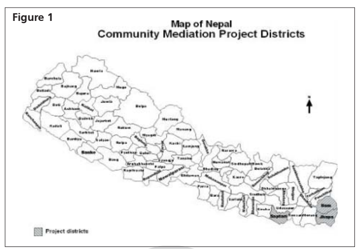
There are a total of 75 districts in Nepal. The three shaded districts in the lower right side of the map indicate the three districts where the community mediation programme is currently being used (Ilam, Jhapa and Saptari).

CVICT initially conducted basic research on the types of disputes occurring in communities. While many community people believed their only option was dealing with the police, in reality, CVICT found many conflicts could be solved without police intervention. As a result, CVICT developed a training course for community leaders, specifically targeting the participation of women and marginalised groups—such as Dalits, the untouchable caste—to settle disputes using a rightsbased community mediation method. Local community members are appointed and trained to be volunteer mediators. The community mediation process is made available for non-criminal disputes open to anyone without regard to age, sex, class, or social caste. The mediators invite the parties to discuss possible agreement options. In general, solutions emerge from the parties and the community itself. A particularly helpful feature in the CVICT model empowers mediators to decide if further investigation or legal action is necessary. This has caused the privileged to be willing to engage in the mediation process because the disadvantaged have a strong advocate.