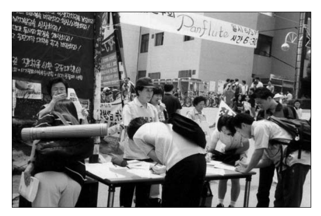
Minimum wage campaign organized by cleaners (Incheon City June, 2003)