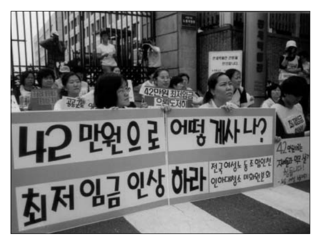
A demonstration at the gate of Korea Minimum Wage Council On the panel is written "Can you live on 420,000 won for a month?" (Seoul, June 25, 2001)

Prior to the use of this tactic, our organization was involved in organizing subcontract women workers to advocate for their rights. In the process of our