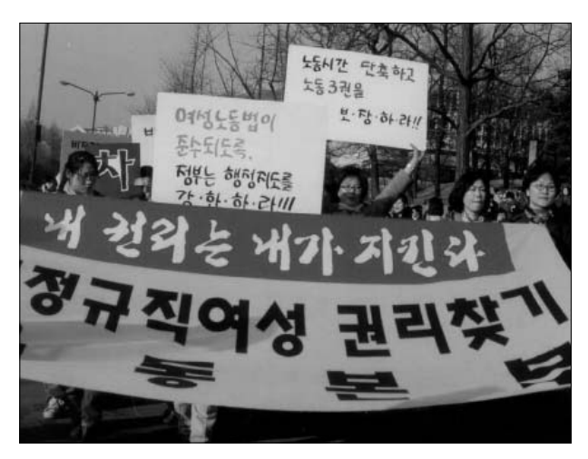
Foundation of Action Center for the Restoration of Irregular Women Workers' Rights (Seoul, March 5, 2000)

The action center also focused on grassroots organizing of irregular women workers through our counseling centers. The KWWAU had eight counseling centers in eight Korean cities. Through our counseling work, we came to learn about the poor working conditions sub-contract cleaners labored under, and the failure of the minimum wage system to provide a living wage.