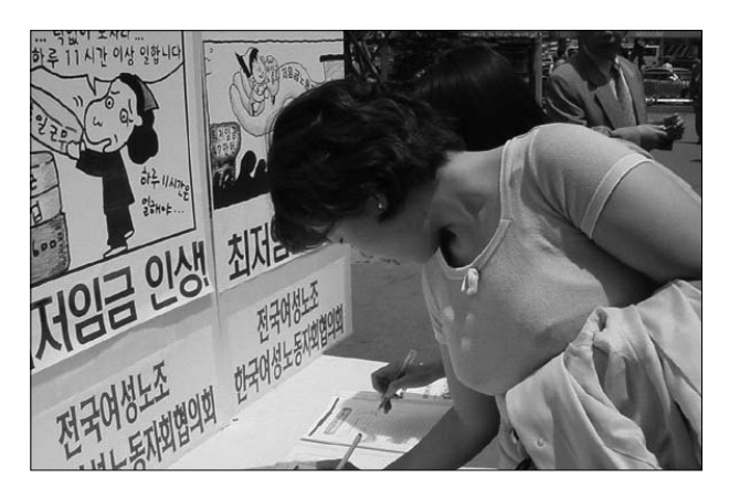
Gathering signatures for the petition (Seoul, May 28, 2002) NOTE: See the cartoon format of the posters that easily caught the eye of the public.

Though most people knew little about the minimum wage system, they agreed to sign the petition to alleviate the suffering of poor workers. In one month, we gathered approximately 15,000 signatures. We also created an on-line board where people could