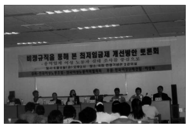
Conference, "How to improve the Minimum Wage System from the Perspective of Sub-contract Workers" (Seoul, June 8, 2001)

The conference was a very significant event. It was the first conference to focus on the issue of the minimum wage system. With our survey results in hand, we were able to use the conference to prove that our demands were reasonable and that South Korea's low income workers faced real challenges. In addition, we could