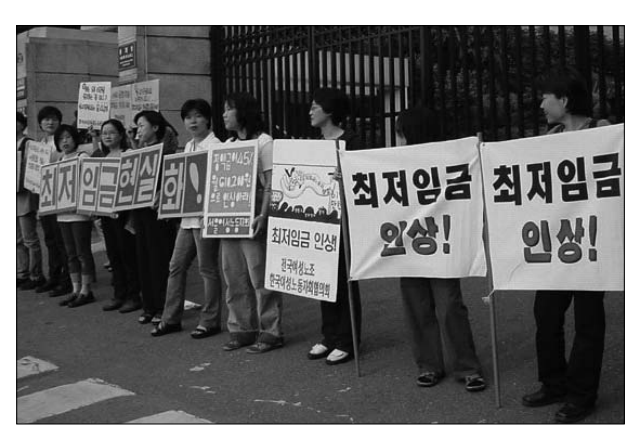
Need copy for photo caption.

events "hunger demonstrations" because we went without breakfast. We could only have a meal once we finished the demonstration around 10:00a.m. By that time, we all felt hungry!