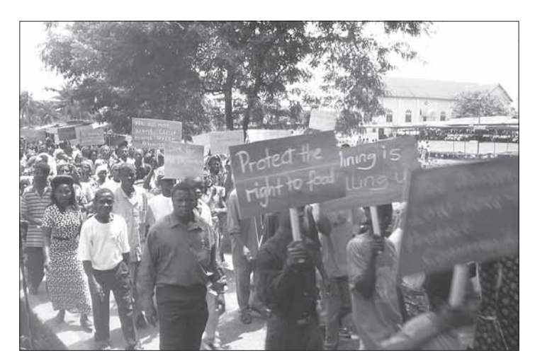
Affected communities protesting against mining, Ghana 2002.

Once you know the investors that are involved, you need to find out as much as possible about them, their specific involvement in that project and their position on human rights.