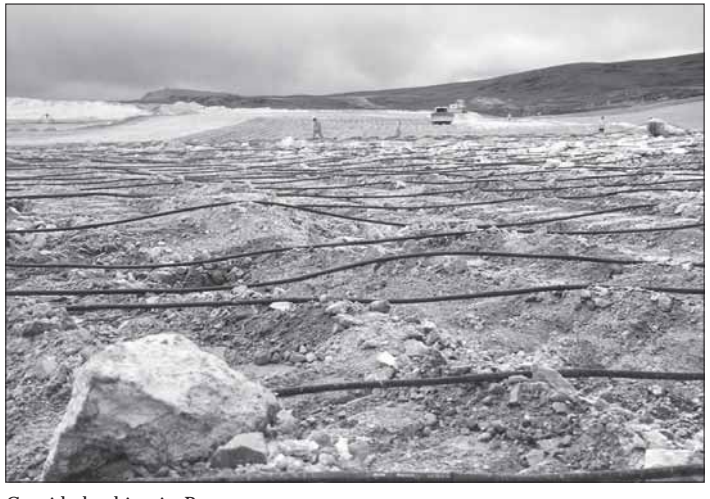
Cyanide leaching in Peru.

officer or analyst looks into all the information relevant to meeting regulatory or other disclosure guidelines. This process is important for the financial institutions because of possible litigation threats. For activists, it's an important entry point. They could argue that the human rights issues might lead to risks and that by not taking these concerns into account the lender doesn't fulfill its "due diligence." This kind of risk-exposure approach is also known as bottomline leverage—one of many types of leverage in financial advocacy.