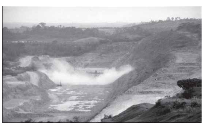
Blasting in the active pit of the Iduapriem mine, 2002.

do more. On the other hand, DEG claimed to already be pressuring the company to produce a community development plan during a process to restructure the loan. But there was no visible progress on the ground and no investigation underway by DEG or IFC themselves. DEG always asked for objective information or "proof" of human rights violations before they could take up the issue. We argued that it was their duty to investigate the issues at stake.