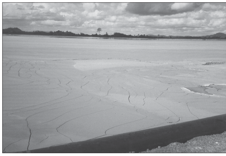
Tailings dam in Ghana.

This notebook explains how the FoodFirst Information and Action Network influenced financial institutions to promote better protections for human rights or to prevent projects that would lead to human rights violations. FIAN Germany used this tactic mainly in a campaign against violations of the right-to-food caused by large surface gold mines. The campaign cooperates closely with affected communities and local organizations. Together with these partners, FIAN investigates the human rights problems of specific mines. We then use a number of instruments to bring the findings to the attention of investors and the pub-