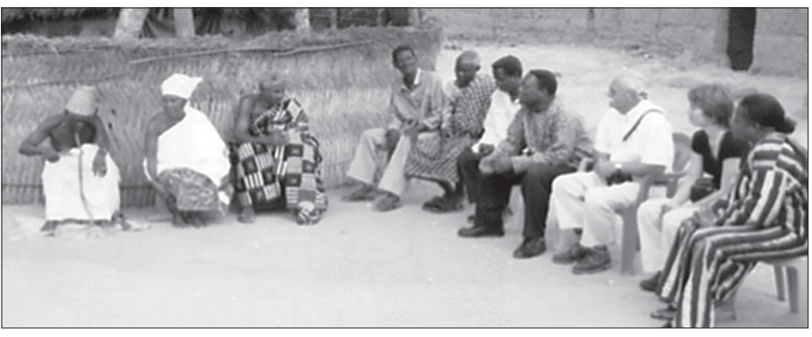
Negotiation / Priests & elders