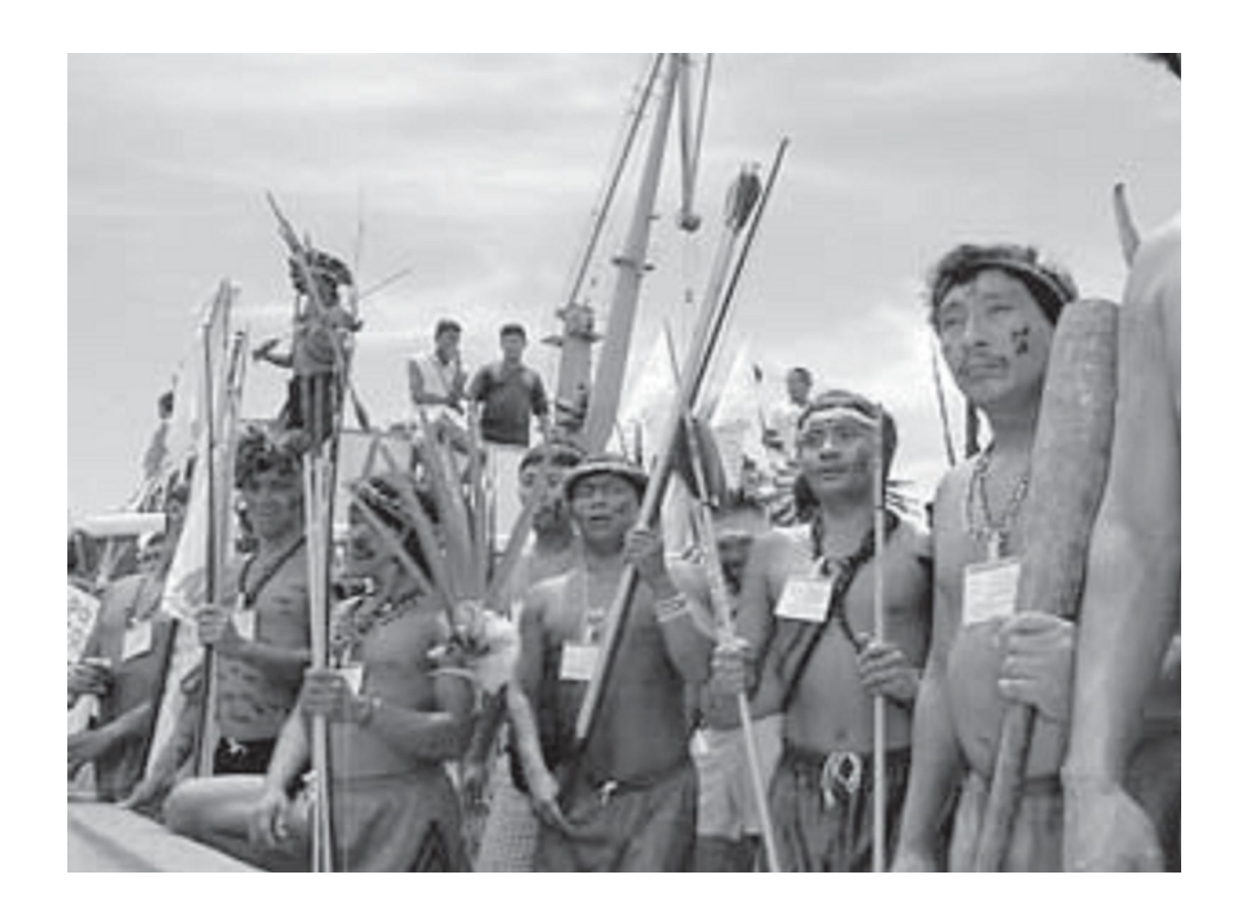
Indigenous Warriors of the Amazon in national mobilization

Then came the mass marches of 2000, when indigenous peoples and organizations, in alliance with other social sectors, contested and opposed the official festivities of the 500th anniversary of the so-called "Discovery of Brazil."