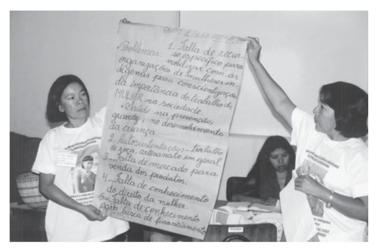
Indigenous leaders of the Amazon analyze the public policies of the government for indigenous communities, during the First Permanent Forum of the Indigenous Peoples of the Brazilian Amazon.

of changes in the treatment of the indigenous question in Brazil, which by tradition has been integrationist, authoritarian, paternalistic, and homogenizing.