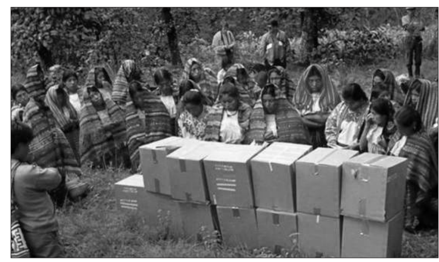
Families of the disappeared in Guatemala praying in front of boxes containing remains exhumed from a clandestine grave.

In every case, but especially in those where state agents are implicated in the crimes, it is essential to work with forensic specialists who are independent of the state. This guarantees the transparency of the process and builds confidence among families. This independence has two aspects. First, there should be no formal affiliation with the state. Second, the actual work of the investigation must be independent of political or other pressure that could result in biased results. For example, when a prisoner is found hanged in his cell in a jail, the official state doctor will usually perform the autopsy. While his work may be professionally sound, it will not be credible to the family because he is affiliated with the official system, and they will ask that a second autopsy be performed by someone from outside the state.