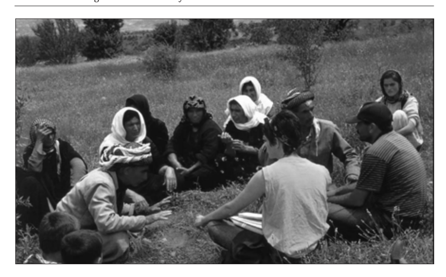
A member of the forensic team interviewing relatives in Iraqi Kurdistan.

In conclusion, human rights violations are not ordinary crimes, but extraordinary, massive and systemic violations, in which the state is often the main perpetrator. In many third world countries and fledgling democracies, political and executive powers can constrain the functioning of the judiciary, impeding the way that justice is investigated and administered. Thus there is always a risk that forensic analyses carried out by local professionals may be compromised.