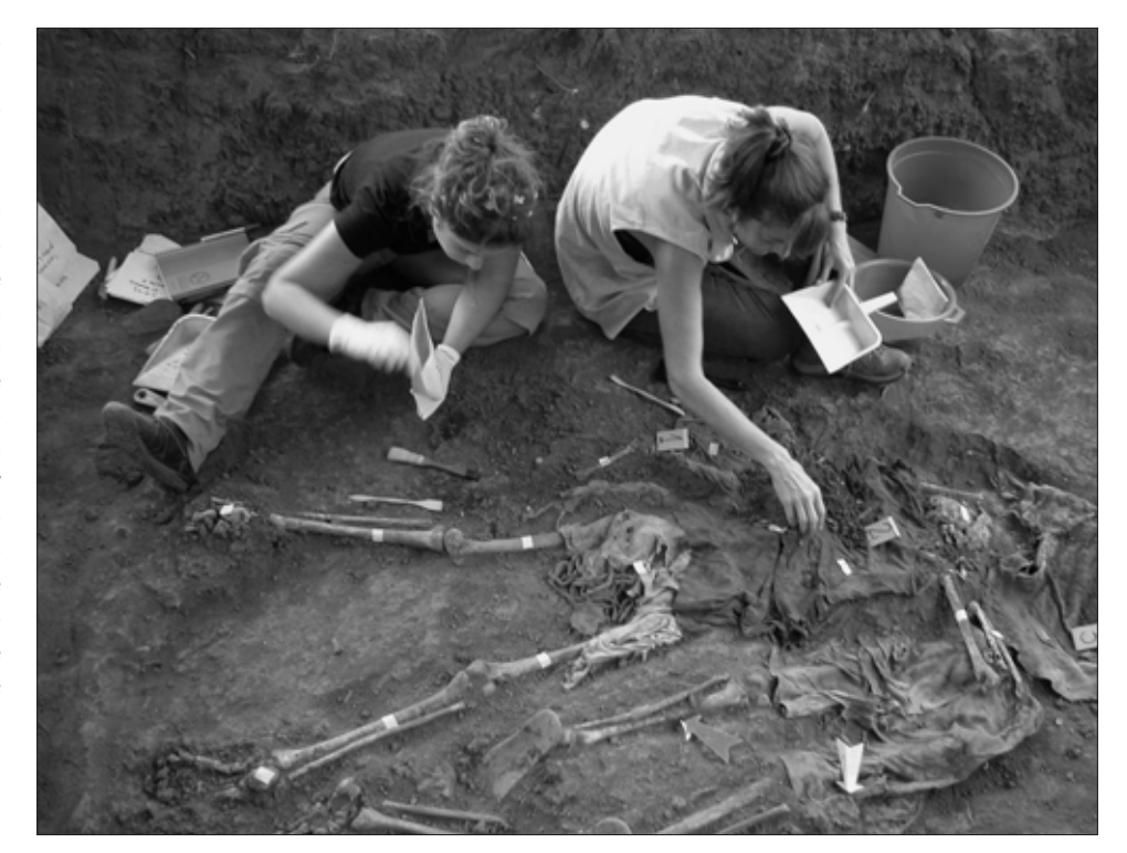
The archeological exhumation of a mass grave in El Salvador.

To achieve this certainty, the expert witness must have integrity and independence. He or she must be free of any pressure to draw a particular conclusion and not be dependent on either party to a dispute. Such independence is particularly important because often the official forensic experts are part of the very same state system that committed the violation.