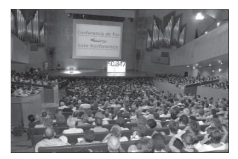
A presentation at the Peace Conference in Bilbao. The number on the screen, 50,847, is the number of signatures collected in support of the process.