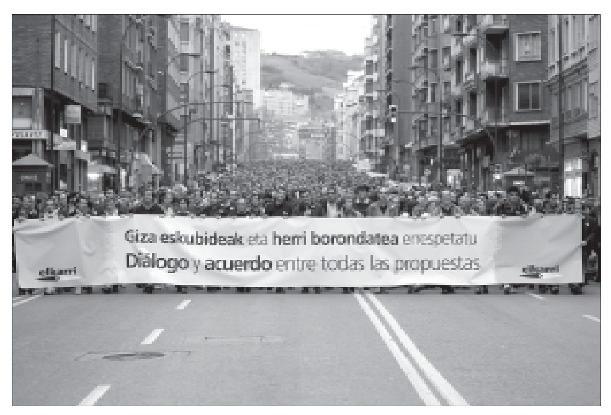
Members and supporters of Elkarri march with representatives of political parties and the government, including the Basque minister of justice and the founder of ETA (although he is no longer involved in ETA). The banner reads, "Dialogue and agreement among all

1 Source: http://www.flashpoints.info/FlashPoints_home.html.