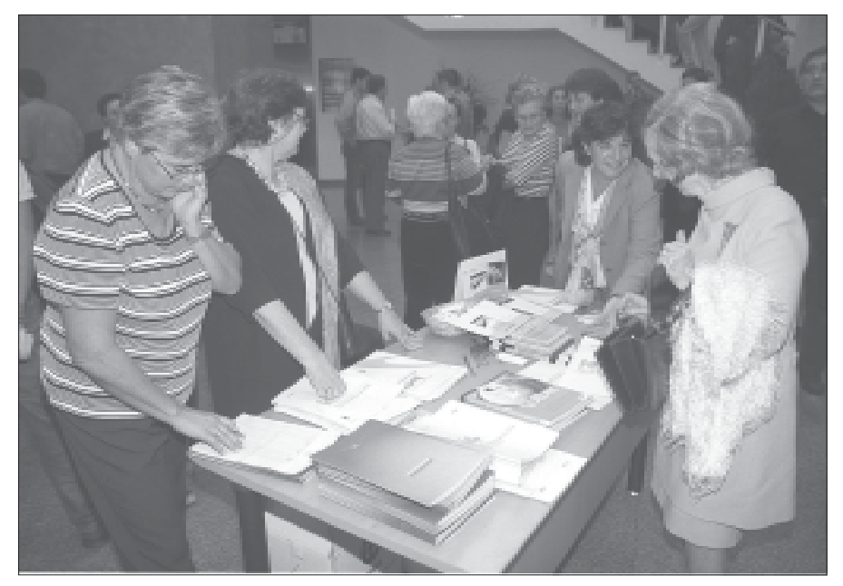
Collecting signatures: Asking people to endorse equality and dialogue.

person who signed the petition. This concrete indication of public support for a process of dialogue toward peace through their signatures and willingness to provide a small monetary donation provided the backbone of the mandate and financial resources (US$500,000) to implement the Peace Conference. The preparatory process culminated on October 7, 2001, in a public event at the Palacio Euskalduna in Bilbao with 2,500 people. This officially launched the Peace Conference methodology, which was conceived and developed to find the widest possible consensus among the public and political forces concerning their participation in dialogue.