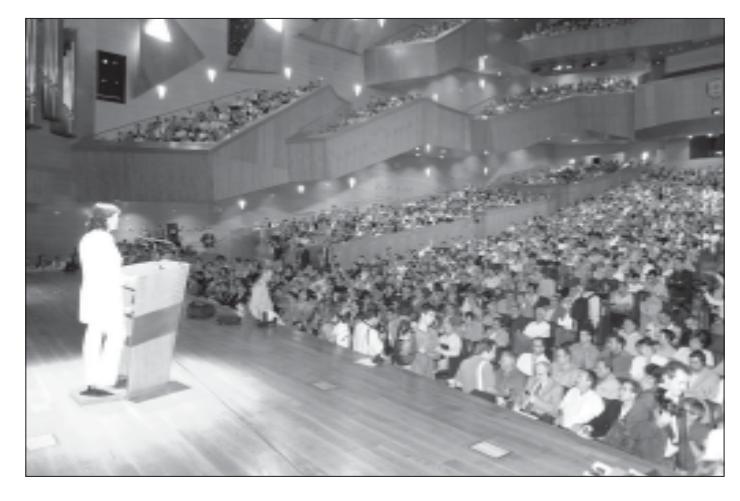
A presentation at the Peace Conference in Euskalduna Palace, Bilbao.